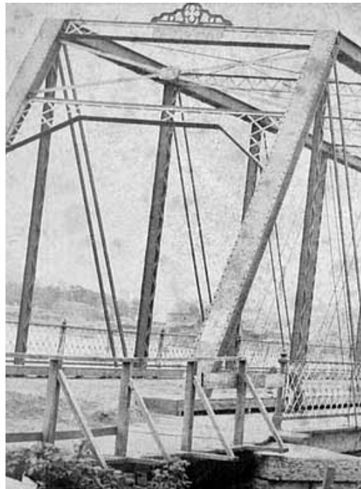
1890 Lowry Bridge

Or by email to: bnabottineau@bottineauneighborhood.org