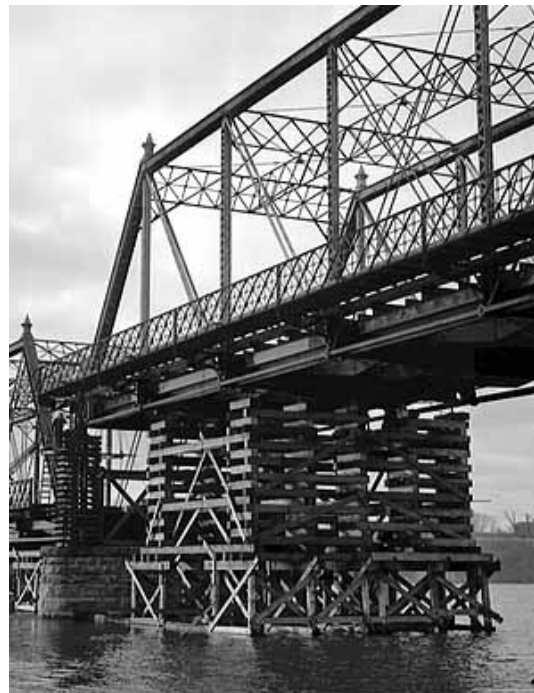
Minnesota Historical Society, Minneapolis Star Journal Tribune, 1950

The original bridge on this site was built in 1887. In the late 1950's the bridge was replaced and lifted 20' primarily to accommodate barge traffic. (See photo below.) A few years ago, the bridge deck was replaced and the bridge repainted. It was discovered during the course of repairs and that one of the piers had shifted up to 11". That initiated the County thoughts about replacing the bridge sooner than later.