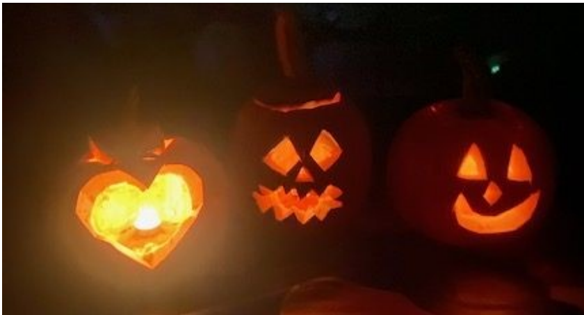
carved pumpkins from the Pumpkin Giveaway

The Bottineau Neighborhood Association gave away 65 pumpkins at our annual fall engagement event. Thank you to our volunteers and our partners, Sentyrz Market and the NE Kiwanis!